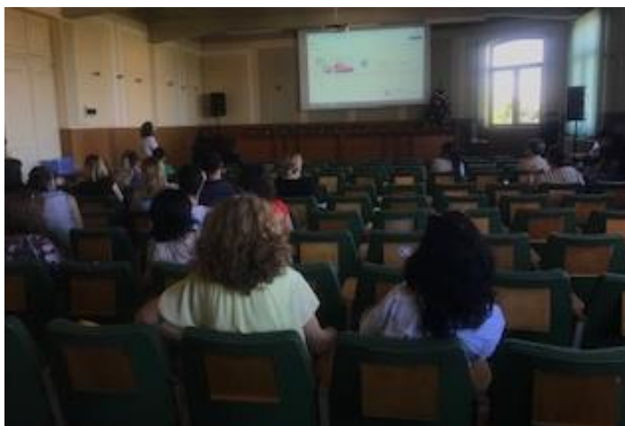
Final Event in Romania