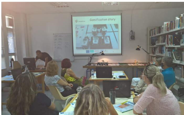
Final Event in Greece